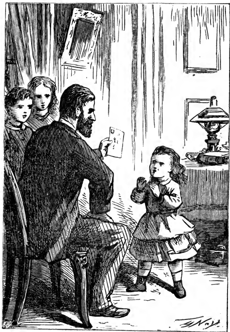
DOTTY'S FIRST POST-OFFICE LETTER. Page 162.